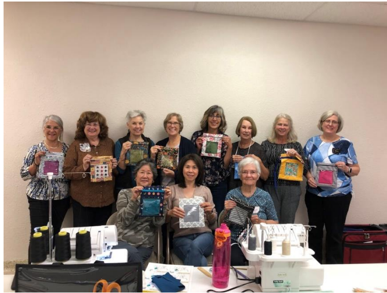
Threads of Love Too